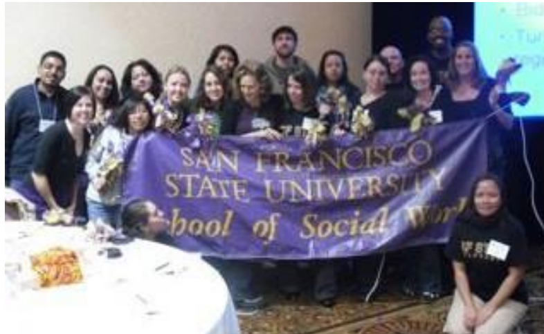
San Francisco State University School of Social Work Lobby Days 2010

Legislative Lobby Days is a two-day event that educates students and professionals about important legislation affecting clients and the social work profession. This is a great opportunity to learn more about the legislative process and get a "hands-on" lobbying experience of talking with state legislators about important policy issues. All students are encouraged to attend.