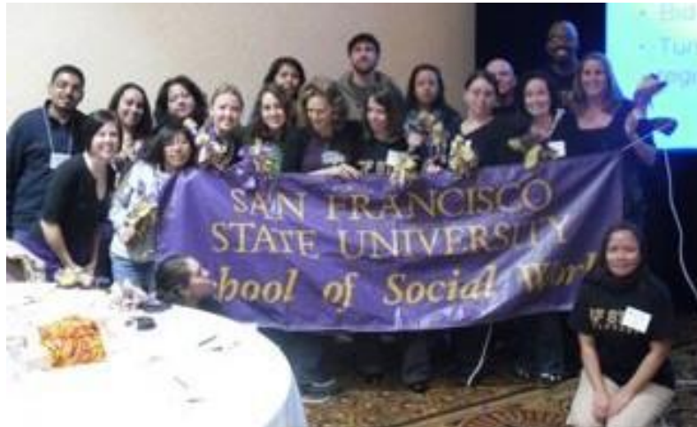
San Francisco State University School of Social Work Lobby Days 2010

Legislative Lobby Days is a two-day event that educates students and professionals about important legislation affecting clients and the social work profession. This is a great opportunity to learn more about the legislative process and get a "hands-on" lobbying experience of talking with state legislators about important policy issues. All students are encouraged to attend.