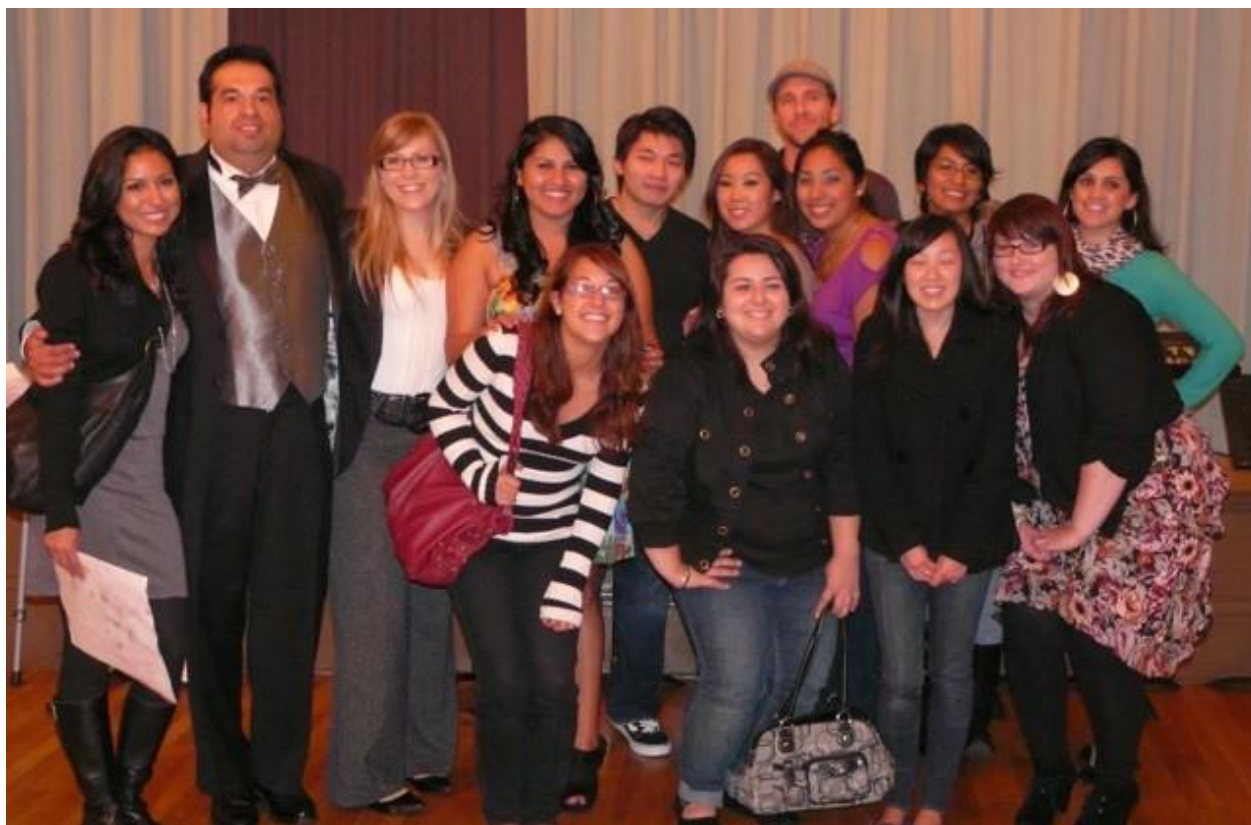
Senior Class 2010-11